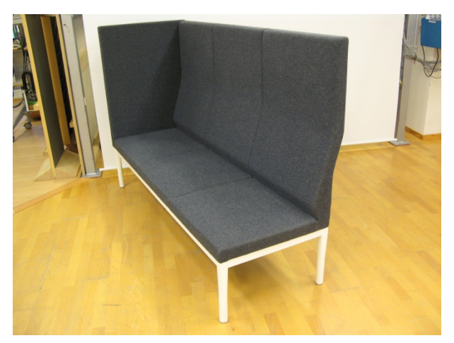
Figure 1 Reform sofa