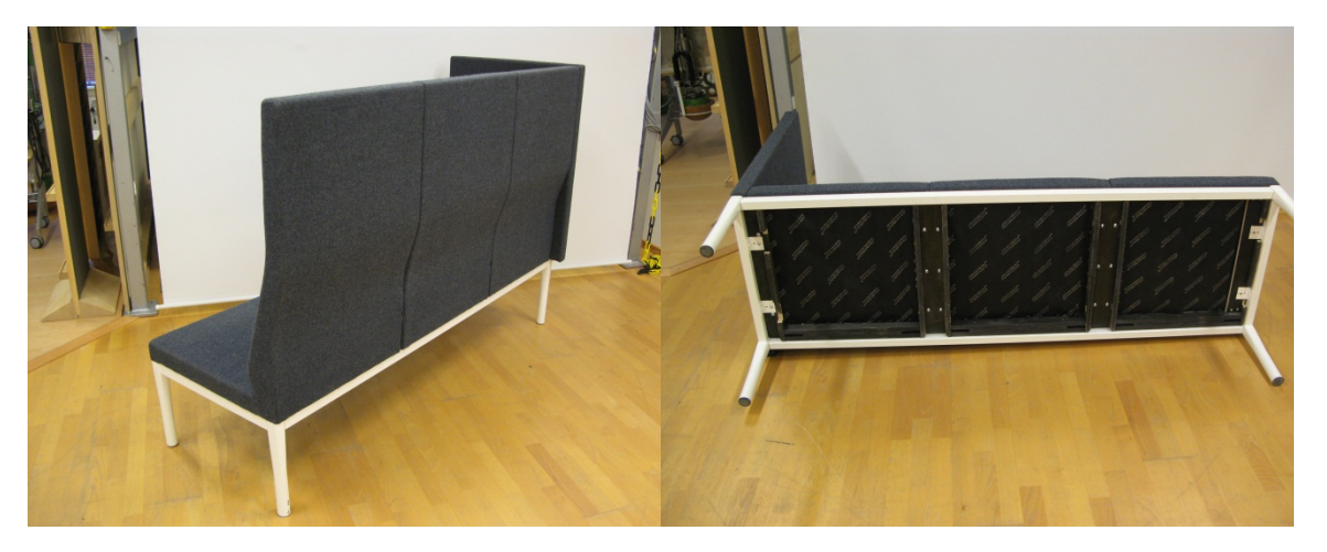
Figure 2 Reform sofa, backside